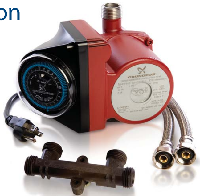
UP 15-10 SU7P TLC (Part# 595916) Pump, valve, line-cord, and (2) S.S. flex hoses.

For more information about the Grundfos Comfort System go to: www.SaveWaterNow.com www.WaterSaverSolutions.com